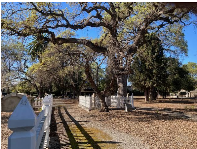
Before and after photos near the Frisbee-Cooley fence