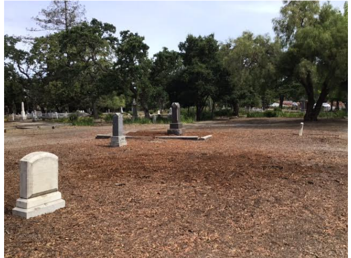
This is right at the entrance. The invasive Acacia trees were getting unsafe and spreading rapidly.